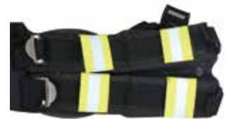
• Nomex strips