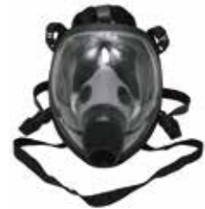
• Natural silicon mask