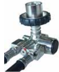
• Pressure regulator