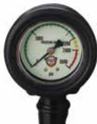
• Pressure gauge