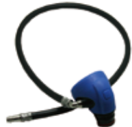
• Demand valve