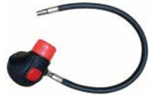
• Demand valve